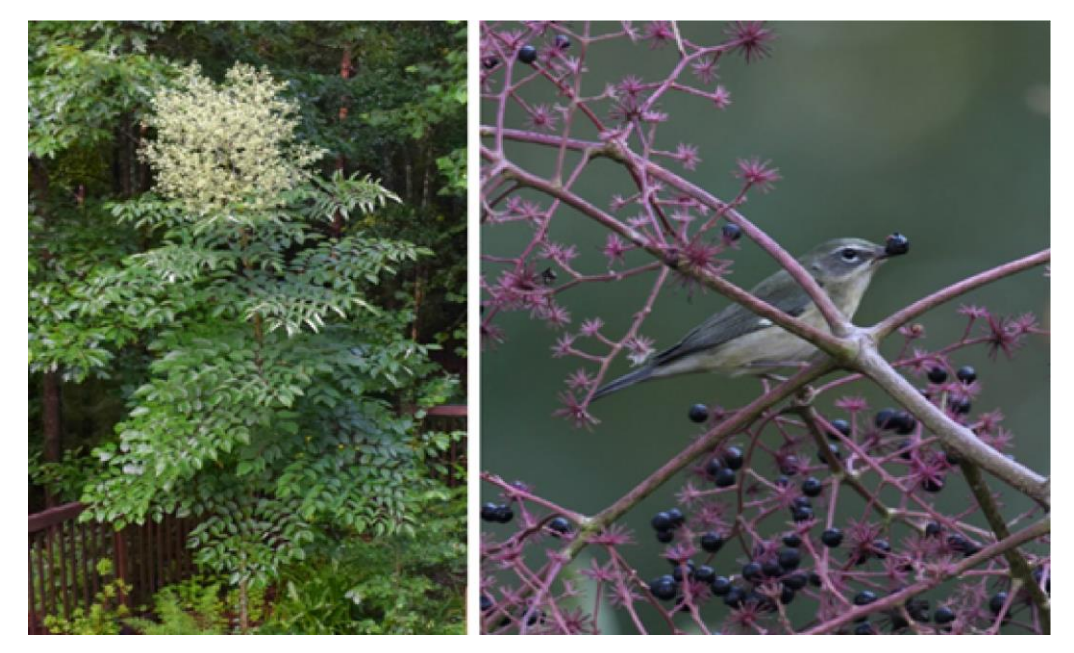
Figure 3. Aralia spinosa.

Considering I am promoting plants for their ecological value, devil's walking stick deserves significant attention. Its spreading, thicket-forming habit makes it valuable for erosion control as well as cover for wildlife. It produces enormous, 3 ft long flower panicles that provide both nectar and pollen rewards to pollinators (Trees, Shrubs, and Woody Vines of Illinois). These flowers are then followed by huge clusters of dark purple berries that are cherished by songbirds of all kinds (Trees, Shrubs, and Woody Vines of Illinois) (Figure 3).