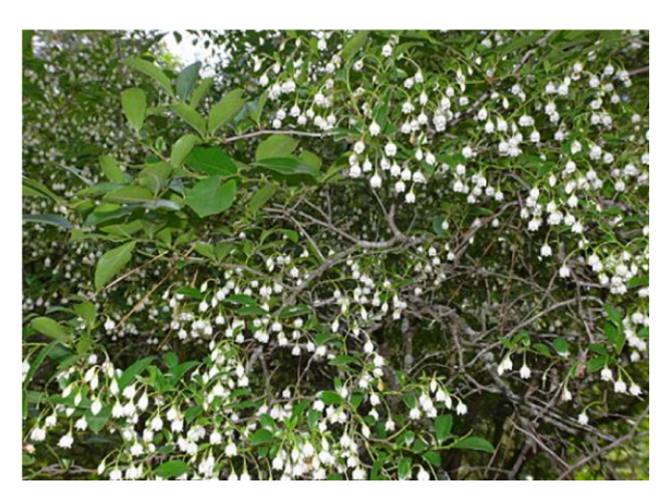
Figure 7. Farkleberry ( Vaccinium arboretum ), Photo credit: Will Cook.

The abundance of flowers is followed by an abundance of fleshy fruits that are consumed by various songbirds.