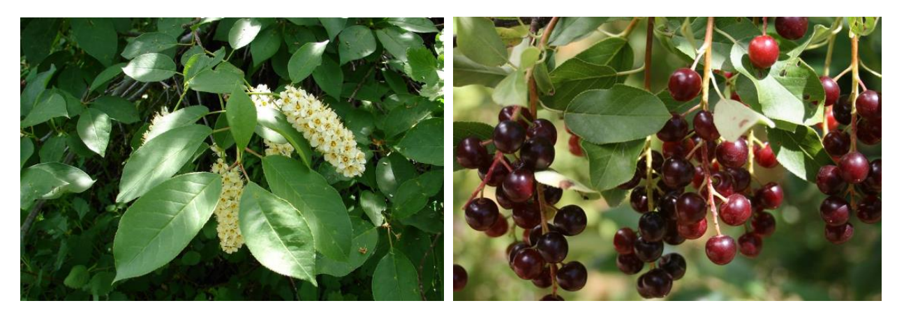
Figure 8. Black cherry (Prunus virginiana), Photo credit: Moonshine Designs Nursery.

Though often written off as a weedy tree, chokecherry combines numerous factors that might well make it the most valuable plant on my list (Figure 8). In spring, chokecherry's long panicles of white flowers attract pollinators of all kinds. It has been found that Prunus spp. are among the best producers of both high-quality pollen and nectar (Collison, 2016). Those flowers are followed by fleshy berries prized by various wildlife, especially songbirds and, containing 30% to 50% fat, they rank among the most nutritious of all berries (Wikipedia). In addition, as a host to 456 different species (Tallamy, 2009), Prunus spp. rank 2<sup>nd</sup> only to Quercus spp. in supporting lepidopteran larvae. What sets chokecherry apart from others in the genus though, is that it tends to form thickets. These thickets provide good nesting and cover sites for various wildlife and help to reduce erosion.