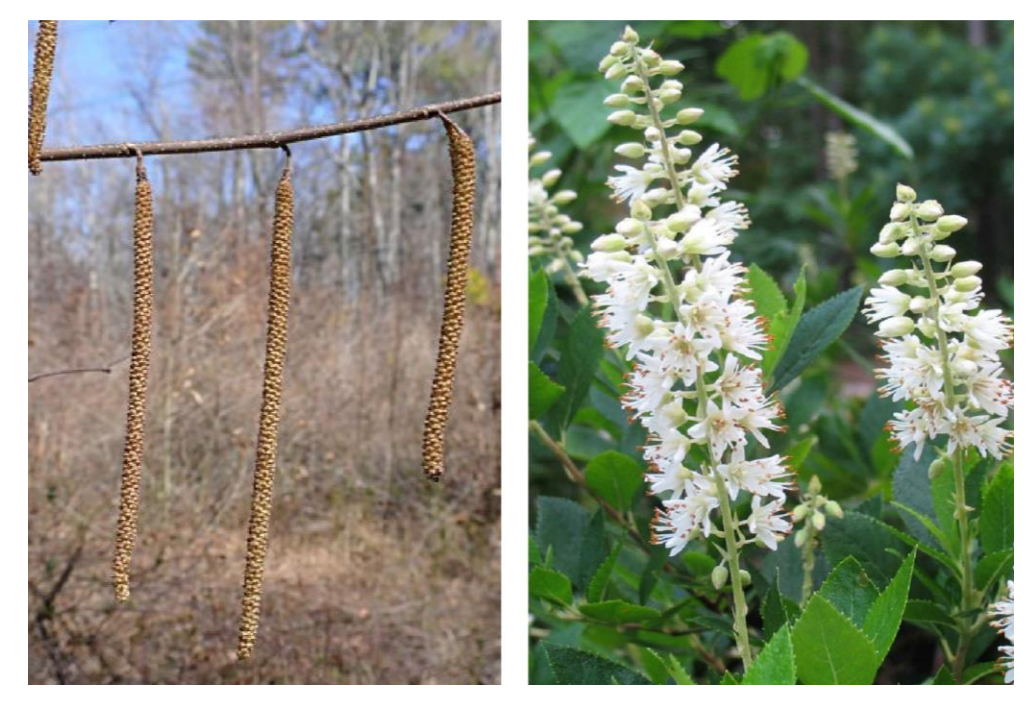
Figure 1. The picture on left is American hazelnut (a great pollen source) Photo credit: Will Cook; and the picture on the right is summersweet (a great nectar source) Photo Credit: Willowbend Nurseries.

Often, however, we forget about the importance of pollen. Jenkins Arboretum's long-time apiarist compared the two with the analogy that pollen is like cheeseburgers and nectar is like candy bars. Pollen, which provides mainly fats and proteins, is truly sustaining and vital to the survival of bees. Nectar on the other hand, provides mainly carbohydrate sugars which provide energy. Both are important, but is one more so than the other? Could it be argued that pollen is more valuable than nectar? Regardless of the answers to these questions, we should be including pollen plants in our lists of plants to attract bees. For the purposes of evaluating a plant's ecological value, species that produce both pollen and nectar are given more consideration than those that provide only one of the two.