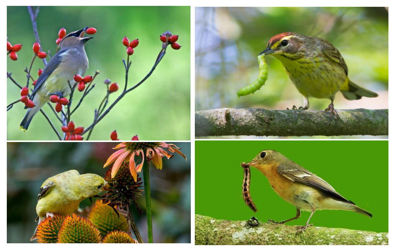
Figure 2. We typically think of berries and seeds. However, plants that host a lot of insects are just as valuable (if not more) than those that produce fleshy fruits or high-quality seeds.