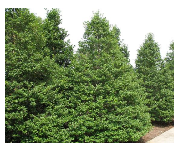
Figure 6. American holly (Ilex opaca).

The only evergreen on my list, American holly has several ecologically valuable traits (Figure 6). Its dense, evergreen branches provide great nesting and cover sites for birds. The flowers provide both nectar (female flowers) and pollen (male flowers) to pollinators (Encyclopedia of Life). In addition, the berries, though not highly nutritious (Encyclopedia of Life), are a valuable source of food for overwintering birds.