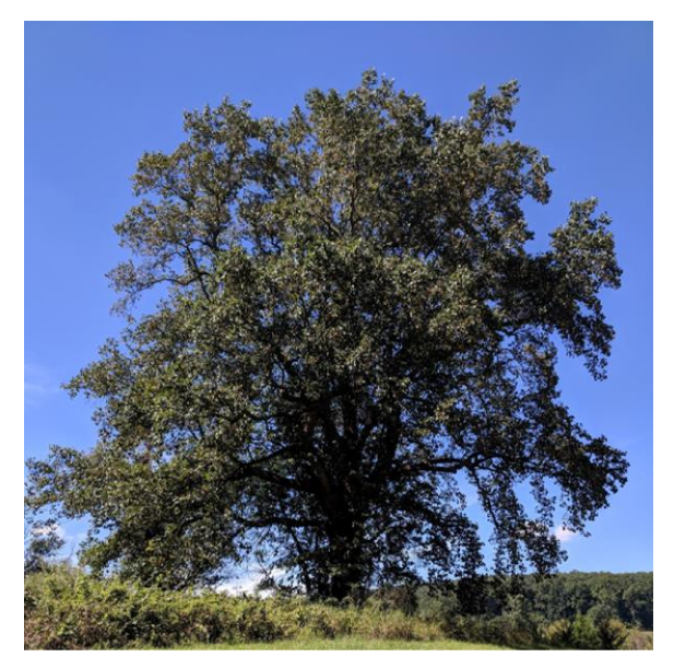
Figure 4. Tulip poplar ( Liriodendron tulipifera ).

Though often dismissed by gardeners for its weedy nature, the tulip poplar provides numerous ecological benefits. Perhaps the most obvious trait of this species is its enormous size (Figure 4). In fact, it is among the largest species in the eastern USA in both girth and height. It is also a very fast grower. Combined, these traits make tulip poplar very valuable for both stormwater mitigation and carbon sequestration. In addition, though they often go unnoticed because they are usually held so high on the tree, the flowers of tulip poplar produce high quality pollen (Eierman, 2013) as well as some of the highest volume of nectar (Angel, 2018).